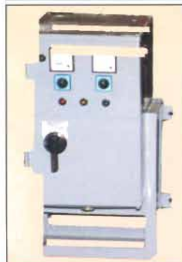
50 KVAR / 440 V 3 ph Capacitor with switch Fuse arrangement