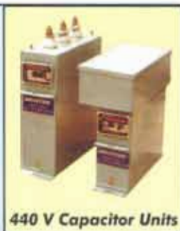
440 V Capacitor Units