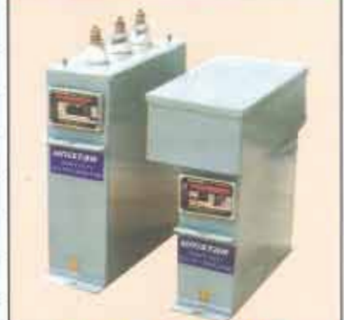
440 V Capacitor Units