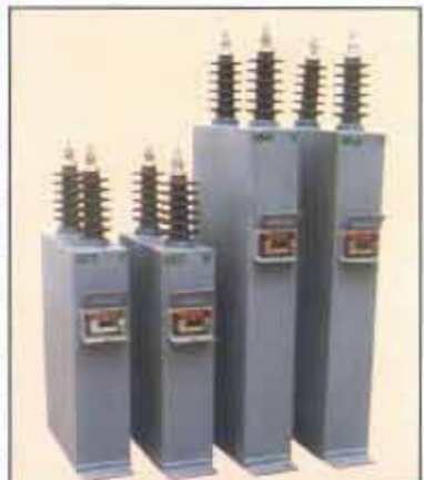
3.3 to 22 KV Capacitor Units