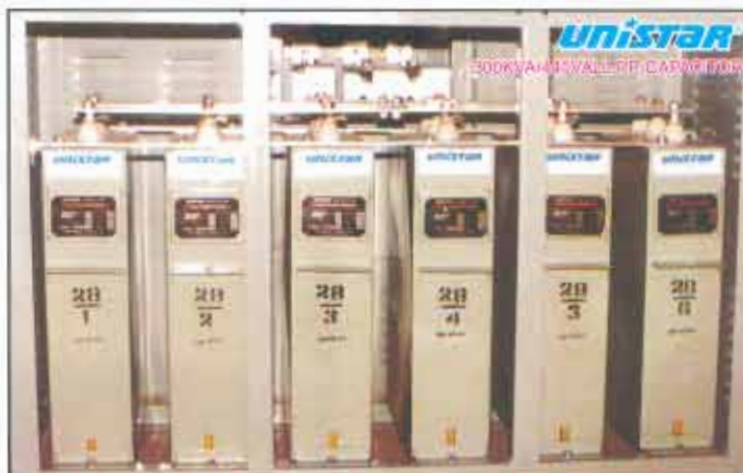
L.T. Capacitor bank in enclosure with IP-55 Protection

UCL is pioneer in introducing All-PP technology in LT range. These capacitors are made using single layer double thickness hazy polypropylene dielectric with Aluminum foil as electrode and imported non PCB oil as impregnate, using the same GE technology of HT capacitors. After extensive trials these capacitors were commercially introduced in the year 1993. Since then their performance have been appreciated by dealers, consultants and customers alike. The stupendous performance of these capacitors over the period muted the critics of All PP and today number of manufacturers have started following technology developed by us.