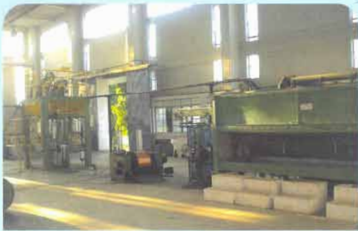
Electro Tinning Plant